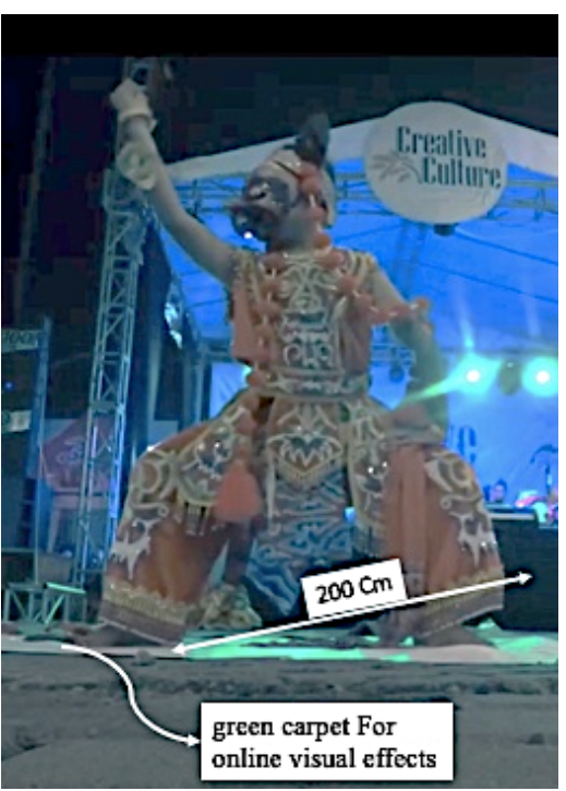
Figure 2. Benjang Mask Performance in pandemic conditions

used, any effects can be identified, and the boundaries of interaction between performers or between performers with the audience can be felt through direct touch or related to responses that are present in all personality situations of the performers. In a concept regarding the close distance of the ritual space, if there are individual performers who fail to bring out their personality when carrying out all their activities, then the public Space that presents the interaction of suggestions cannot be fulfilled.