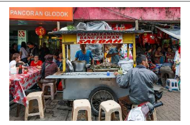
Figure 1. Overview of Street Culinary Indonesian Food