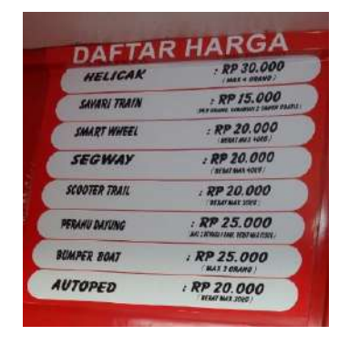
Figure 5. (Left) List one of the food menus. (Right) List of Rides